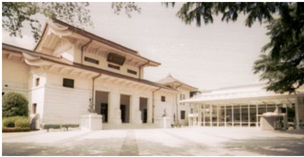
The Yushukan Museum

the museum that stands on the grounds of Yasukuni Shrine. Both visiting and receiving Japanese and South Korean officials are engaged in a psychological war in which foreign and domestic situations are intricately entangled.