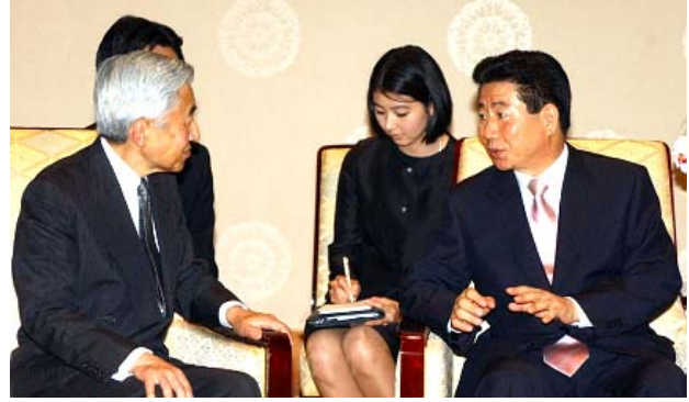
Emperor Akihito meeting with South Korean President Roh Moo-hyun

The same pattern applies to the administration of Fukuda's father, former Prime Minister Fukuda Takeo, under whom Fukuda served as an aide. In 1978, the senior Fukuda significantly advanced "Japan-China reconciliation" by signing the Japan-China Peace and Friendship Treaty by placating rightist opponents. It was also around the same time that the Fukuda administration paved the way for the enactment of the Gengo (the name of a Japanese era) Law in 1979. This law, too, was established in response to fervent requests from rightists.