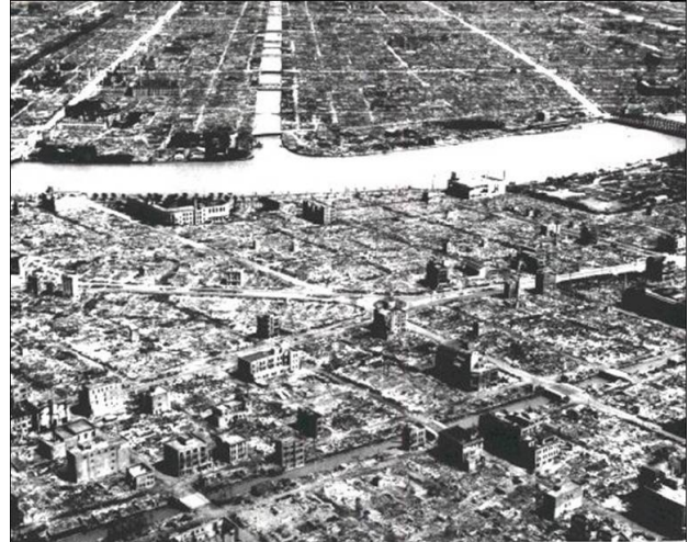
Photograph of Tokyo in the wake of firebombing of March 10, 1945

Author Saotome Katsumoto wrote in 2002 of the “war on terror”: “Terrorism is, of course, a form of violence difficult to forgive, but the war being waged in retaliation is also violence ... where and in what way can we put on the brakes?” [3] For Saotome, war is wrong, and the “war on terror” an unjustifiable threat to world peace. Saotome, a survivor of the 10 March 1945 American air raid on Tokyo that killed over 100,000 civilians and left five million homeless, became a popular anti-war author. He is also a veteran grass-roots socialist activist and a lifelong supporter of progressive politics. After writing for Akahata (Red Flag), the Japan Communist Party paper in the 1960s and the 1970s, Saotome moved into a career as a writer of non-fiction. [4] He is one of Japan’s most prolific authors on subjects of war and peace having written volumes for some of the most significant non-fiction series in the Japanese language – the Shinsho series from Iwanami Shoten aimed at adults and the Iwanami Junior Shinsho and Kusa no ne haha to ko de miru (Grassroots mother and child see) series for children. These works are a staple at public and school libraries across Japan and at major booksellers.