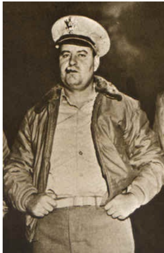
General Curtis LeMay

Saotome extends the discussion of LeMay and civilian bombing to the Vietnam War: "LeMay, using the B52 strategic bomber ... in place of the B29, rained North Vietnam with fire – genocidal indiscriminate bombing – all the while saying 'I'll bomb them back into the stone age.'" [19]