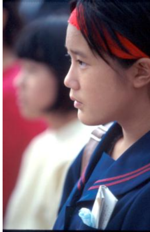
Middle school protestor

Though the numbers of participants in the activities of the "Ten Districts Association" fell off, we still took every possible opportunity and tried every device we could imagine to make the opposition of local residents known at city, prefecture and national government levels. Both the national government and Nago City regard only the "Three Districts" as the "designated area," and even though a higher level of noise disturbance is predicted for it than for the "Three Districts" in the event of the airport being built, still the "Ten Districts" are considered only "surrounding districts," and are left outside the net, without any explanation. When we submitted to Nago City a demand for a meeting of explanation, signed by two-thirds of the local residents, it was ignored.