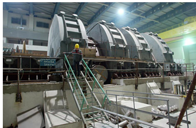
The Bushehr nuclear power plant