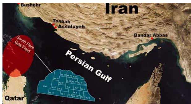
The South Pars Field

Russia's number one priority in energy cooperation with Iran will be for upstream participation by Russian companies. Gazprom has had some limited participation so far in the early phases of Iran's massive South Pars gas fields with an estimated aggregate cumulative production range of a stunning 13 trillion cubic meters. Moscow will be keen to promote greater involvement. Gazprom has shown interest in the Iran-Pakistan-India pipeline project not only as a contractor but also as an investor.