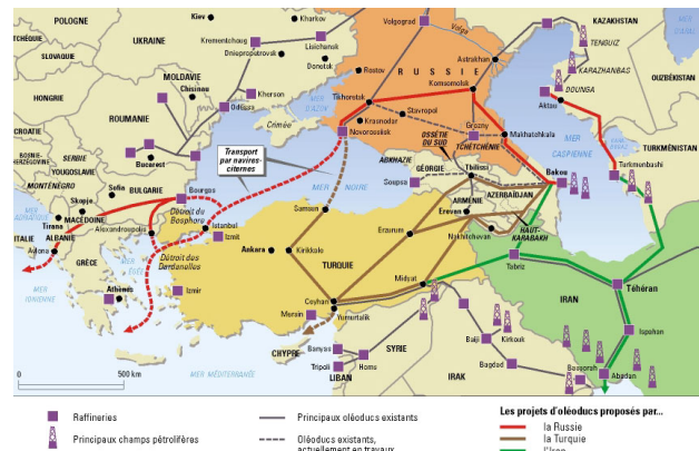
Caspian oil and gas pipelines and projected lines

agreement relating to the Caspian littoral pipeline on December 12 with his Kazakh and Turkmen counterparts, the curtain came down on one of the grimmest struggles of the great game in the post-Soviet era. Moscow came out the winner by far, reasserting its pre-eminent position in the Caspian.