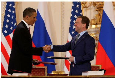
Barack Obama and Dmitry Medvedev after signing the “New Start Treaty” in Prague in April 2010

New START and Arms Reductions. From the beginning, the Obama Administration (2009–2016) had placed a strong emphasis on nuclear force reductions and an updated nuclear posture. In 2010, the United States and Russia agreed to the New START treaty, which entered into force in 2011. It reduces the number of deployed strategic weapons to 1,550 for each party, with this limit to be reached by February 2018. The treaty expires in 2021 unless it is extended or superseded by another treaty. 2 New START was widely seen as a logical next step for bilateral nuclear arms control between Russia and the United States: it further lowers the number of deployed strategic nuclear weapons, if not by a big margin, and it preserves the extensive and well-established verification regime of the original START Treaty, which expired in 2009.