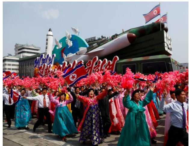
The Military Parade in Pyongyang, North Korea. April 2017

Secretary of State Rex Tillerson has declared that with regard to North Korea "the policy of strategic patience has ended. We are exploring a new range of diplomatic, security, and economic measures. All options are on the table." 49 Tillerson explained that this includes the use of force: "Certainly, we do not want to—for things to get to a military conflict. [...] If [the North Koreans] elevate the threat of their weapons program to a level that we believe requires action, that option is on the table."