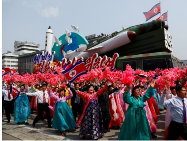
The Military Parade in Pyongyang, North Korea. April 2017

The scale of the challenge has been described by Anthony Blinken, a deputy secretary of state in the Obama administration, “Much of North Korea’s nuclear complex is concealed underground, inside mountains or in places unknown to United States intelligence. Meanwhile, the country is making rapid progress with mobile missiles powered by solid rocket fuel that can be rolled out of hiding and prepared for launch in minutes.” 50 As for U.S. options, Blinken suggested, “even if we had an effective pre-emptive strike capacity, the consequences of using it could be prohibitive.”