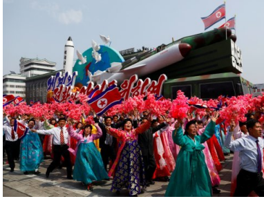
The Military Parade in Pyongyang, North Korea. April 2017

The scale of the challenge has been described by Anthony Blinken, a deputy secretary of state in the Obama administration, “Much of North Korea’s nuclear complex is concealed underground, inside mountains or in places unknown to United States intelligence. Meanwhile, the country is making rapid progress with mobile missiles powered by solid rocket fuel that can be rolled out of hiding and prepared for launch in minutes.” 50 As for U.S. options, Blinken suggested, “even if we had an effective pre-emptive strike capacity, the consequences of using it could be prohibitive.”