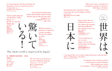
Pages 2-3 of METI’s Wonder NIPPON! : “The whole world is impressed by Japan!” This page is filled with comments praising Japan in English, French, Chinese, Malay, Indonesian and Vietnamese, with Japanese translations. Interestingly, comments by Europeans and Americans are introduced with their names, while comments by Asians are by nameless “international students.”

aiming “to convey Japan’s unique sensibilities and values to the rest of the world as the foundation of commodities and services provided under the Cool Japan Initiative.” Wonder NIPPON! is filled with expressions emblematic of the “Japan Is Great” genre, such as “The whole world is impressed by Japan!,” “Japanese people’s unique view of nature,” and so forth. Their list of references (p.35) includes classic Nihonjinron works such as Ruth Benedict’s The Chrysanthemum and the Sword (1946), Doi Takeo’s Anatomy of Dependence (1971), and even The Japanese and the Jews (1970) by conservative critic Yamamoto Shichihei (1921-1991), who published the work under the authorship of a pseudonymous “Isaiah Ben-Dasan.” METI’s Wonder NIPPON! is nothing but a typical “Japan-Is-Great” book, officially produced, promoted, and disseminated by the government.