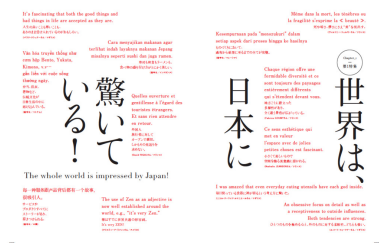
Pages 2-3 of METI’s Wonder NIPPON! : “The whole world is impressed by Japan!” This page is filled with comments praising Japan in English, French, Chinese, Malay, Indonesian and Vietnamese, with Japanese translations. Interestingly, comments by Europeans and Americans are introduced with their names, while comments by Asians are by nameless “international students.”

aiming “to convey Japan’s unique sensibilities and values to the rest of the world as the foundation of commodities and services provided under the Cool Japan Initiative.” Wonder NIPPON! is filled with expressions emblematic of the “Japan Is Great” genre, such as “The whole world is impressed by Japan!,” “Japanese people’s unique view of nature,” and so forth. Their list of references (p.35) includes classic Nihonjinron works such as Ruth Benedict’s The Chrysanthemum and the Sword (1946), Doi Takeo’s Anatomy of Dependence (1971), and even The Japanese and the Jews (1970) by conservative critic Yamamoto Shichihei (1921-1991), who published the work under the authorship of a pseudonymous “Isaiah Ben-Dasan.” METI’s Wonder NIPPON! is nothing but a typical “Japan-Is-Great” book, officially produced, promoted, and disseminated by the government.