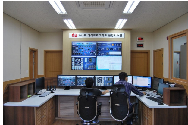
Gasa Island Microgrid Control Centre