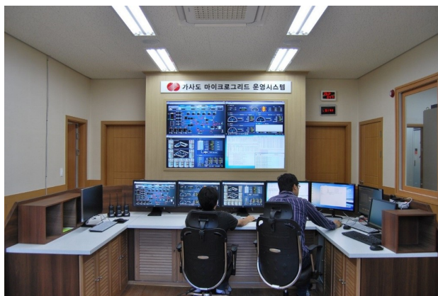
Gasa Island Microgrid Control Centre: Courtesy of KEPCO.

Of course, as with all new technological advances, challenges remain. The most significant is that in the short-term, the initial outlay of costs in installing a microgrid system is substantially higher than investing in diesel power plants. However, in Chae Wookyu's view (the chief engineer in the Gasa Island project), the initial cost of approximately 4.2 billion Won for a microgrid system could be recouped within 16 years of operation. 55 He expects these savings would arise from lower fuel and management costs while providing electricity at the cheaper rates mentioned above. Doing away with the exorbitant costs of transporting barrels of diesel alone, could arguably achieve significant cost savings. Separate reports by foreign competitors such as Caterpillar in 2016 estimate a payback period of only 5 to 6 years. 56 Independent commentary by Navigant Research estimates an even more ambitious figure of four years or less to gain a Return On Investment (ROI) (assuming cost of diesel at $1/L), up to three years at $1.36/L and up to two years at $1.64/L. 57