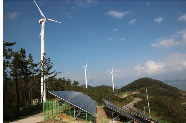
Wind turbines and solar panels used in Microgrid on Gasa Island: Courtesy of KEPCO.

The Gasa island project is a prototype for as many as 86 other island-based projects planned by KEPCO. The company is planning to roll out the microgrid on the much larger Ulleong Island with just over 10,000 residents (and five other island locations) in the East Sea by late 2017/early 2018. The microgrid system of these islands will be constructed by private firms such as Korea Telecom (Deokjeok Island), Woojin Industrial Systems (Sapsi Island), POSCO (Chuja Island), LG CNS (Geomun Island), and by KEPCO (with LG CNS) on Ulleung Island and Geocha Island (KEPCO). 48 It is envisaged that private energy producers will form Power Purchase Agreements to sell electricity to KEPCO. 49 One of the main goals in the next development phase of these microgrid projects is to increase the renewable make-up of energy sources on islands such as Ulleung to 100 percent by 2021. 50 It is noteworthy that for companies such as LG CNS, their ability to provide microgrid solutions was based on the company's experiences in the Jeju Island Smart Grid testbed. 51