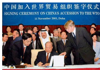
11 November 2001

Meanwhile, fixated on consumption, job creation in the US manufacturing sector continued its long descent – falling from a modern peak of 32% of total nonfarm employment in 1952 to just 8.5% in late 2016. Needless to say, this latter trend – traceable in large part to technological change, international specialization, and globalization – largely predates the rise of modern China; in fact, more than 80% of the decline in the manufacturing share of US employment had occurred prior to China’s WTO accession in late 2001. This point seems all but lost on a Trump Administration that wants to blame America’s secular decline in manufacturing jobs on the more recent rise of China.