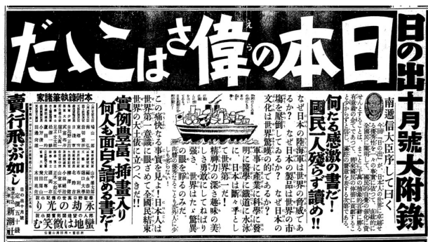
Advertisement for the magazine, Hinode (Rising Sun) that appeared in Tokyo Asahi Shimbun, dated September 7, 1933