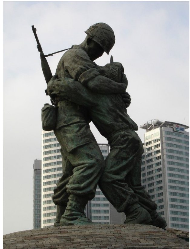
Monument in front of the Korean War museum in Seoul: Two brothers meet on the battlefield. Note the obviously hierarchic relationship between the armed South Korean (left) and the unarmed and much smaller North Korean (right). 2

On February 10, 2016, the South Korean government announced that it would close the Kaesŏng Industrial Zone (KIZ) in response to the North Korean nuclear test of January 6 th and the launch of a satellite on February 7 th . The zone, sometimes simply called by the name of the adjacent city of Kaesŏng, had been the last tangible outcome of the historic first inter-Korean summit of June 2000, which later that year had earned one of its two participants, the South Korean president Kim Dae-jung, the Nobel Peace Prize. His counterpart Kim Jong-il, who hosted the summit, received none. He was compensated generously by what has been rumored to be millions of dollars from South Korea. The payment was allegedly facilitated by Hyundai. 1 That is the same company that managed the Mt. Kŭmgang tourism project in North Korea, another successful joint project that has been frozen since 2008. Through its subsidiary Asan, Hyundai also built the Kaesŏng industrial zone.