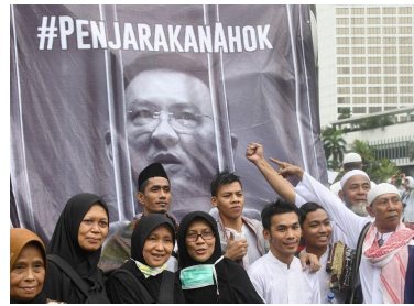
Muslims protest against Jakarta Governor Basuki "Ahok" Tjahaja Purnama, who is Chinese Christian in December 2016

Some observers have blamed this funding for the riots in 2016-17 protesting the re-election campaign of the Christian Chinese governor of Jakarta, Basuki Tjahaja Purna ("Ahok"). 3 Only one person died in these protests, compared to the thousand killed in the riots preceding Suharto's ouster in 1998. But it was alarming to see hundreds of thousands of Muslims shouting anti-Christian and anti-Chinese slogans, and to see him not only defeated, but convicted on a trumped-up blasphemy charge. (The judges ignored the much more lenient recommendation of Ahok's prosecutors and capitulated to inflamed public opinion.)