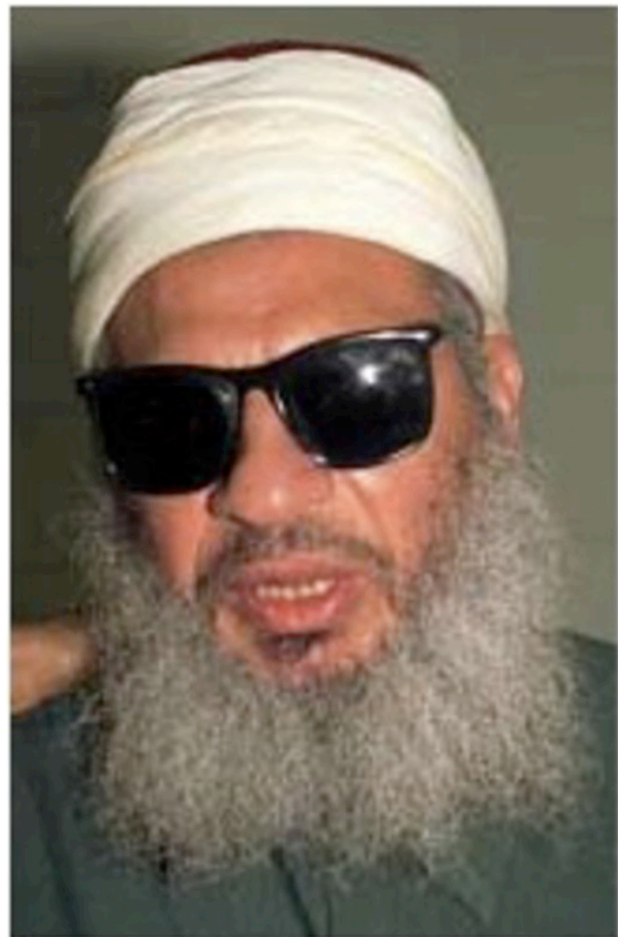
Sheik Omar Abdel Rahman

The CIA may have wanted to think that the Al-Kifah training was only for Afghanistan. But the blind Sheikh Omar Abdel Rahman, the mentor of the Center whom the CIA brought to America in 1990, was preaching for the killing of Jews and also for the destruction of the West. 35 His preachings guided Mohamed's Makhtab trainees: as a first step, in November 1990, three of them conspired to kill Meir Kahane, the founder of the Jewish Defense League.