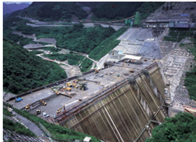
Takizawa Dam, second construction