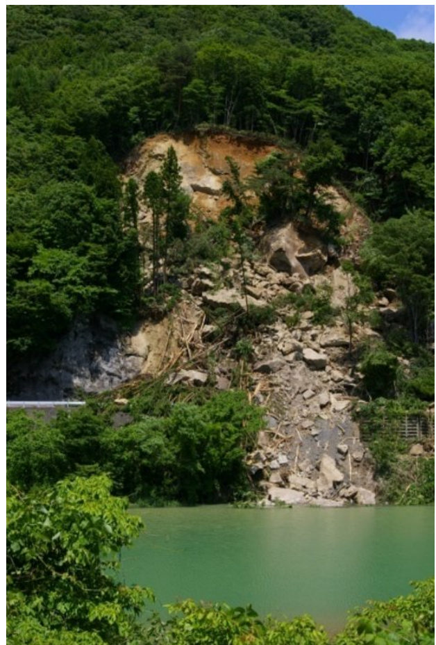
The Iwate-Miyagi Nairiku Earthquake