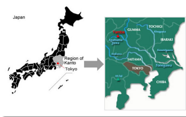
Yamba Dam map

The Transportation Ministry has designated the slopes around the reservoir site as susceptible to landslides and determined that 22 locations are likely to weaken when the reservoir is filled. In the end, however, the ministry decided to take preventive measures in just six spots “where stored water is highly likely to lead to landslides.” The region around the dam has been repeatedly subject to volcanic activity, and, as is even reported on the Transportation Ministry’s website, it is the location of a hydrothermally-altered zone. Areas that have such a zone and experience other volcanic activity are particularly vulnerable to landslides.