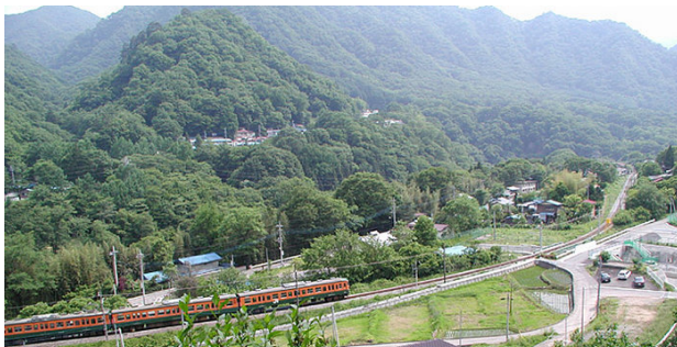
Mountains and community at the Yamba dam site

Okunishi contends, “but it is wrong to believe that these methods ensure safety in this area.” The method that is being used is called “milk” because it involves infusing milk-colored cement into the rock to strengthen it. Dam builders often comment that, “You can never be sure if things will work out, until you build the dam. There are limits to what you can determine even from boring samples of the rock.” Workers “infuse as much ‘milk’ as they can to fill up the gaps in the rock until no more will go in.” Okunishi sees a danger in the attitude that, “if we proceed with this construction method something will work out.” In addition, such practices are one of the primary reasons why the costs of dams always bloat beyond what is originally projected. Officials contend that “because they don’t know how much it will cost,” they cannot come up with a precise budgetary request so they start with smaller requests for funding.