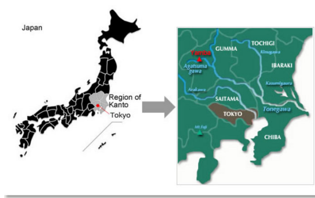
Yamba Dam map

The Transportation Ministry has designated the slopes around the reservoir site as susceptible to landslides and determined that 22 locations are likely to weaken when the reservoir is filled. In the end, however, the ministry decided to take preventive measures in just six spots “where stored water is highly likely to lead to landslides.” The region around the dam has been repeatedly subject to volcanic activity, and, as is even reported on the Transportation Ministry’s website, it is the location of a hydrothermally-altered zone. Areas that have such a zone and experience other volcanic activity are particularly vulnerable to landslides.