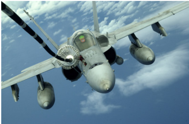
A US F/A-18D from Marine Corps Air Station Iwakuni, Japan, refuels over the Pacific Ocean from a KC-10 Extender

Vietnam War in Guam in mid-June. Moreover, China's participation for the first time as an observer in the Valiant Shield exercise is a further blow to North Korea, perhaps even a factor provoking to July 4 missile tests. Strategic shifts in the region, particularly those involving the US-Japan and US-ROK military alliance surely increase North Korean sense of isolation. On the other hand, to the extent that the ROK can use its strengthened security relationship with the US to increase awareness of the regional possibilities of an accord, positive outcomes seem possible. Prior to a peace treaty ending the Korean War, a US-North Korea and North Korea-South Korea détente, it seems inescapable that South Korean governments will continue to hedge their bets between strengthening the US-ROK relationship and further opening toward the North.