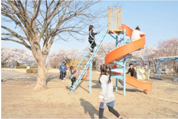
Children at play at Yonomori Park, April 21, 2012 at the peak of cherry blossom viewing

Suzuki Tokiko (64), who lives near the park, detected 0.97 uSv per hour there with her own dosimeter on April 20th. When she informed the city, she says they responded that “The radiation level is low and you can enjoy cherry blossom viewing without problems.”