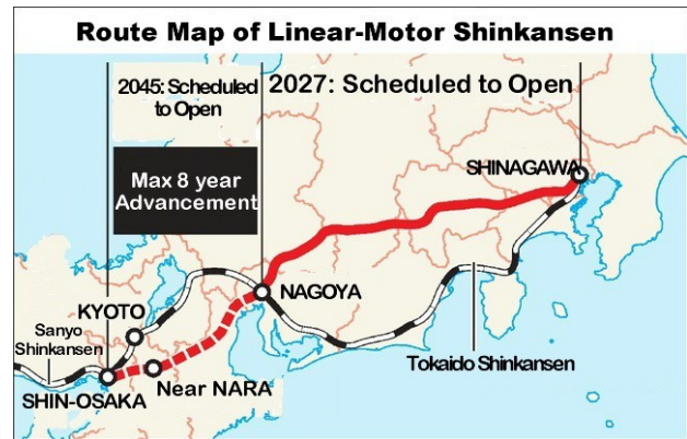
Route Map of the Linear Shinkansen

The Linear Shinkansen plan is a project to connect Tokyo-Osaka (438 kms) in 67 minutes by magnetically levitated (superconducting maglev.) bullet trains, with a maximum speed of 505 km/h and for a total cost estimated at 9.03 trillion yen. The first stage object is to start service on the Tokyo-Nagoya 286 kms sector by 2027, for an investment of 5.43 trillion yen. Overall completion of the line through to Osaka, under the revised Abe government plan, is to occur in 2037. 2