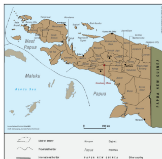
Map Two showing the territory of West Papua including the Indonesian provinces of Papua and Papua Barat (West Papua) and the administrative regions called kabupaten (regencies).

( http://apjif.org/#_ftn3 ) of the entire population of West Papua (Papua and Papua Barat provinces) in 2010. The figures received from the BPS are from the 2010 census and identify the inhabitants of Papua province as either Suku Papua (Papuan tribe) or Suku Bukan Papua 4 ( http://apjif.org/#_ftn4 ) (non-Papuan tribe). According to these figures out of a total population of 2,883,381 in Papua Province, some 2,121,436 were Papuan (73.57%) and 658,708 Non-Papuan (22.84%), the remainder being unknown. The BPS figures for Papua Barat show that the total population is 753,399 of which 51.49% is Papuan 5 ( http://apjif.org/#_ftn5 ).