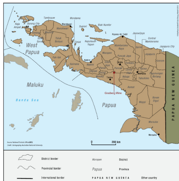
Map Two showing the territory of West Papua including the Indonesian provinces of Papua and Papua Barat (West Papua) and the administrative regions called kabupaten (regencies).

population was 1.84% and that of the non-Papuan population 10.82% 2 ( http://apjjf.org/#_ftn2 ) for the period from 1971 up to 2000. From my calculations this meant that indigenous Papuans comprised about 48% 3 ( http://apjjf.org/#_ftn3 ) of the entire population of West Papua (Papua and Papua Barat provinces) in 2010. The figures received from the BPS are from the 2010 census and identify the inhabitants of Papua province as either Suku Papua (Papuan tribe) or Suku Bukan Papua 4 ( http://apjjf.org/#_ftn4 ) (non-Papuan tribe). According to these figures out of a total population of 2,883,381 in Papua Province, some 2,121,436 were Papuan (73.57%) and 658,708 Non-Papuan (22.84%), the remainder being unknown. The BPS figures for Papua Barat show that the total population is 753,399 of which 51.49% is Papuan 5 ( http://apjjf.org/#_ftn5 ).