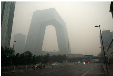
Will Beijing escape from underneath its "smog dome"?

during that time and will continue to argue that recent developments are too little too late. However, it could be argued that the Chinese government's commitments on paper, combined with mounting evidence that positive change is happening on the ground, demonstrate a capacity to drive the greening of the economy to an extent that green supporters in advanced democratic countries (and I have Australia primarily in mind) can only dream about. It may be a long shot, but as of October 2016 I'd still place my money on the Chinese government to play a positive role in "lifting the dome" in the decade ahead, both domestically and internationally as well. Given an increasingly environmentally aware public, whose demand for greener living will only increase with time, the preservation of Party power is at stake: and that's the best incentive of all.