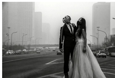
According to Under the Dome, Beijing's daily PM2.5 level is five times that of China's average.

place, and which produce emissions that are 500 times the national standard. In theory, the Atmospheric Pollution Prevention Act 大气污染防治法 of 2002 could be used to shut down the manufacture of such cars, but Chai discovers that no government department has been charged with enforcing the act. She records an official at the Ministry of Environmental Protection (MEP) saying, "As far as we know, it's not us". One from the Ministry of Industry and Information Technology tells her, "It's definitely not us". A third from the General Administration of Quality Supervision and Inspection insists, "It should be all three of us". Finally, she calls an official at the National People's Congress who tells her: "The issue of the execution of this law is indeed unclear". He acknowledges that they'd made it that way on purpose because so many government departments opposed the act. The result puts manufacturers in a corner. As one of the factory owners explains: "If we build real trucks and others build fake trucks, we would be bankrupt tomorrow". An MEP official admits, "Not enforcing the law forces people to cheat".