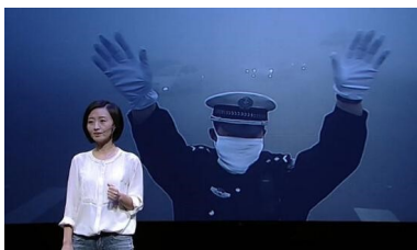
A still from the documentary Under the Dome with Chai Jing in the foreground.

Four decades of rapid economic growth in China has come at a huge price to the environment, from smog-ridden skies to contaminated rivers, toxic soils and “cancer villages”. These increasingly intolerable costs have emerged as a major source of social unrest in recent years. Premier Li Keqiang acknowledged this in his opening address to the National People’s Congress (NPC) on 5 March 2015: “China’s growing pollution problems are a blight on people’s quality of life and a trouble that weighs on their hearts” ( http://online.wsj.com/public/resources/documents/NPC2015_WorkReport_ENG.pdf ).