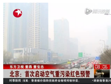
December 2015: Chinese authorities issue their first ever 'red alert' for Beijing as acrid smog enveloped the capital.

The rhetoric of the highest levels of government, including its threat of "iron-handed punishment" for environmental lawbreakers, signals a sincere interest in tackling China's environmental problems. Yet without a more systemic program of environmental management within China, similarly strong commitments by all the nations of the world and substantial personal efforts on the part of the world's 7.3 billion individuals (especially the billion or so richest ones) it is hard to imagine how we will ever escape from "under the dome".