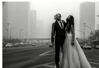
According to Under the Dome, Beijing's daily PM2.5 level is five times that of China's average.

place, and which produce emissions that are 500 times the national standard. In theory, the Atmospheric Pollution Prevention Act 大气污染防治法 of 2002 could be used to shut down the manufacture of such cars, but Chai discovers that no government department has been charged with enforcing the act. She records an official at the Ministry of Environmental Protection (MEP) saying, "As far as we know, it's not us". One from the Ministry of Industry and Information Technology tells her, "It's definitely not us". A third from the General Administration of Quality Supervision and Inspection insists, "It should be all three of us". Finally, she calls an official at the National People's Congress who tells her: "The issue of the execution of this law is indeed unclear". He acknowledges that they'd made it that way on purpose because so many government departments opposed the act. The result puts manufacturers in a corner. As one of the factory owners explains: "If we build real trucks and others build fake trucks, we would be bankrupt tomorrow". An MEP official admits, "Not enforcing the law forces people to cheat".