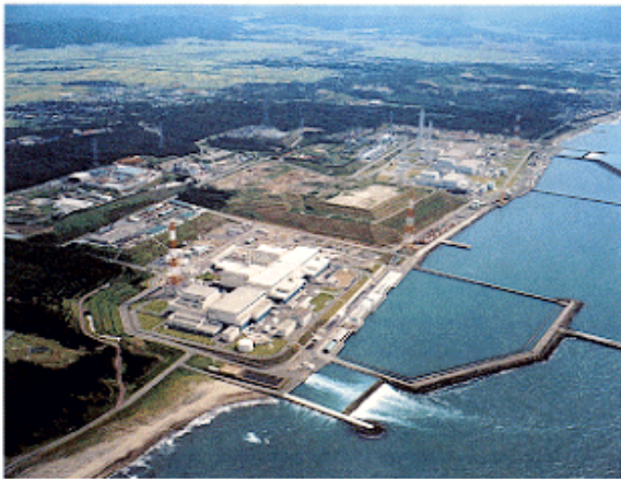
The Kashiwazaki-Kariwa plant

That would have been a catastrophic event where the damaging effects of the quake itself and radiation leaked from the plant reinforced each other.