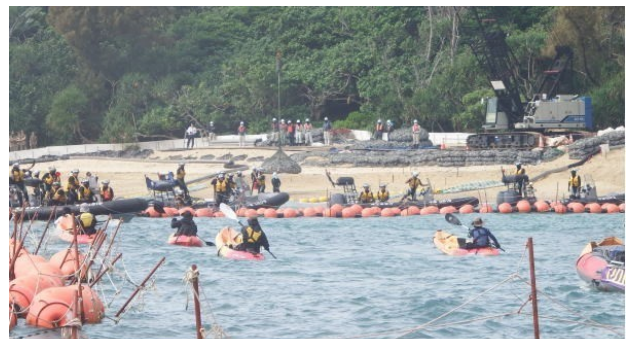
Construction begins as protestors kayaks cry out “stop!” April 25, 2017

It was a bitter day for Okinawa. The Japanese government showed, again, its blunt willingness to impose yet greater U.S. military burdens on Okinawa and its disregard for the voice of the people of Okinawa against base construction and for protection of the environment.