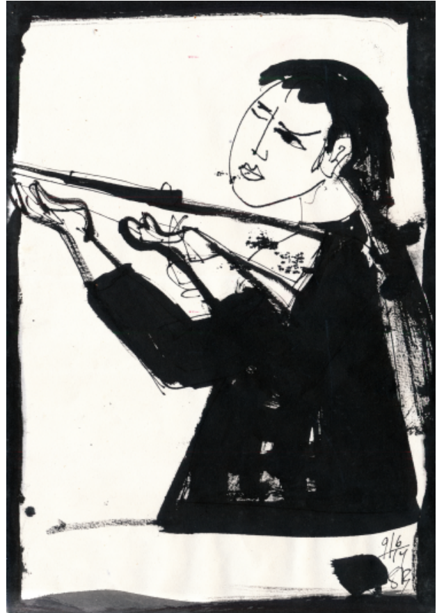
© 2017 - George Burchett, VC Girl , ink on paper, 9.6.14

This is what he wrote in his book, The Furtive War, the United States in Vietnam and Laos ( http://www.marxistsfr.org/archive/burchett/1963/the-furtive-war/index.htm ) (1962) in a chapter titled War Against Trees ( http://www.marxistsfr.org/archive/burchett/1963/the-furtive-war/ch03.htm ):