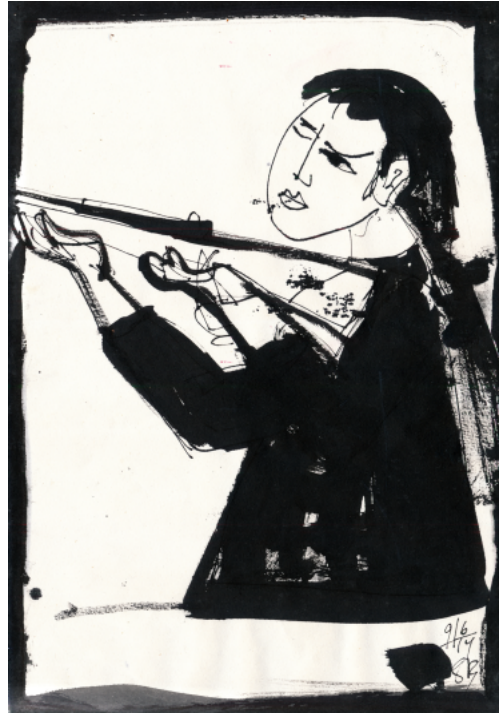
© 2017 - George Burchett, VC Girl , ink on paper, 9.6.14

This is what he wrote in his book, The Furtive War, the United States in Vietnam and Laos ( http://www.marxistsfr.org/archive/burchett/1963/the-furtive-war/index.htm ) (1962) in a chapter titled War Against Trees ( http://www.marxistsfr.org/archive/burchett/1963/the-furtive-war/ch03.htm ):