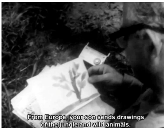
From Europe, your son sends drawings of the jungle and wild animals.

"From Europe, your son sends drawings of the jungle and wild animals. He is a little afraid for you, but he doesn't yet know that here the most dangerous animals are American imperialists."