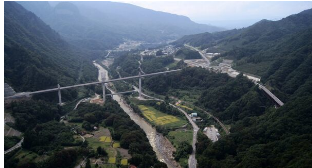
Site of Yanba Dam, 2011

River system north of Tokyo (first planned in 1952), and in general strove, however ineffectually, to shift the priority from concrete to people.