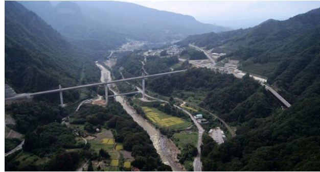
Site of Yanba Dam, 2011

River system north of Tokyo (first planned in 1952), and in general strove, however ineffectually, to shift the priority from concrete to people.