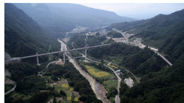
Site of Yanba Dam, 2011

“construction state” or “doken kokka,” in which for decades state-led investment in infrastructure had been sacrosanct. Coming into office, the Democratic Party reconsidered the priority attaching to roads, bridges, river systems, sea walls, power and transport systems, opened to reconsideration of major projects such as the Yamba dam on the upper reaches of the Tone River system north of Tokyo (first planned in 1952), and in general strove, however ineffectually, to shift the priority from concrete to people.