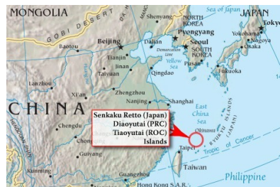
Japan, the People's Republic of China and the Republic of China all claim the Senkaku/ Diaoyutai/ Tiaoyutai Islands

foreign "infringements" – Japan has an unstable and ambiguous new domestic law regime that could potentially authorize action that would violate international law.