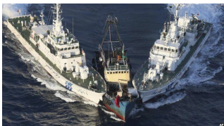
Activists from Japan, China and Taiwan have attempted to sail to the Senkaku/ Diaoyutai Islands

( http://www.jurist.org/forum/2015/09/craig-martin-japan-constitutionalism.php )). But leaving those issues aside, several of the changes also raise international law issues, which have been subject to far less scrutiny within Japan, and have gone virtually unnoticed outside of Japan.