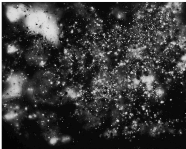
Trace #7, Nihonmatsu Castle (Nihonmatsu, Fukushima)

In 'Trace', which received its Japan debut at the Fukushima Biennale 2012, he collected soil samples from 12 different locations of historical and cultural value while traveling in the Tōhoku-Kantō area with hip-hop activist Shingo Annen and architect Keisuke Hiei (temples, shrines, battle sites, ruins, a hospital). Takeda used an 'auto-radiographic' process in which he exposed the soil samples to photo-sensitive materials in a light-sealed box over 1 month (gelatin silver halide film). The ionising products scattered on the soil permanently imprinted the film as decay continued. By minimising his interference in this way, like Hesse-Honegger, Takeda has devised an accessible way to record and display the chemical and radiological reactions inherent to the soil's active ingredients (mass-time-heat).