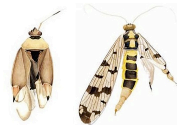
Left: Soft bug (Miridae) from Gösgen, Switzerland ; Right: Scorpion fly (Panorpis Communis) from Reuenthal, Switzerland